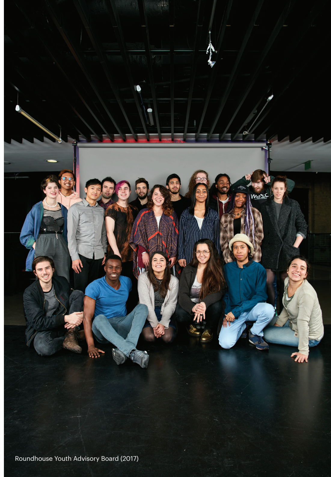
Roundhouse Youth Advisory Board (2017)