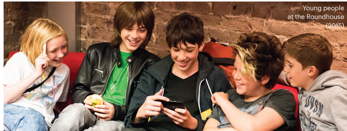
Young people at the Roundhouse (2015)

However, other organisations – such as Contact Manchester or #iwill – have had success in recruiting young people for a full three-year tenure, with some young people even being re-appointed at the end of their term. This has allowed their young trustees to build confidence over time and to gain a deep understanding of the organisation.