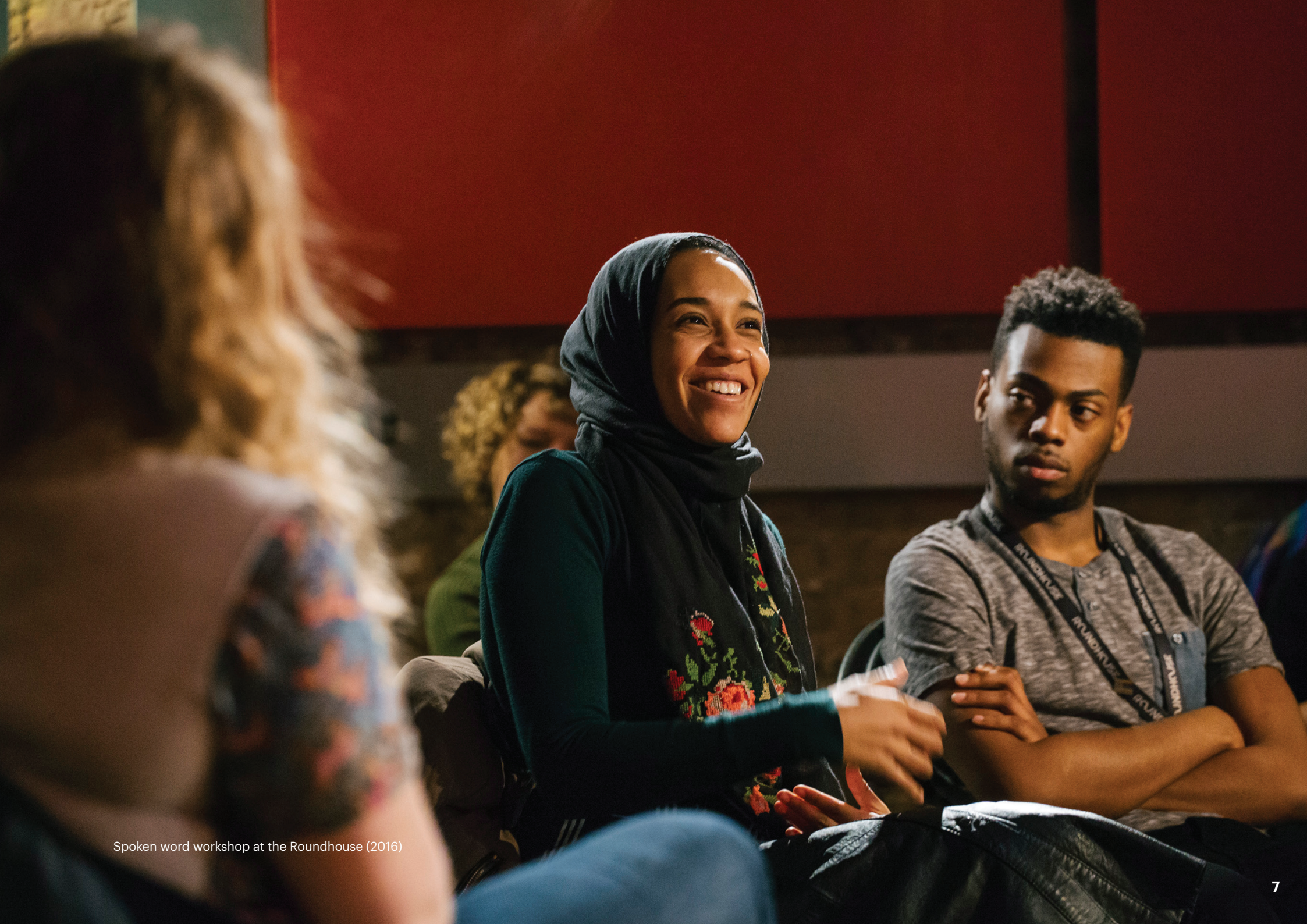
Spoken word workshop at the Roundhouse (2016)